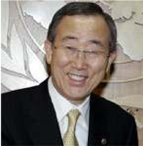
Ban: "A bland and placatory public speaker"?

As he prepares to take office as Secretary General of the United Nations on New Year's Day, Ban Ki-moon, South Korea's foreign minister, has vowed to improve the institution's beleaguered reputation. Some of the changes he has in mind, like improving coordination among the U.N.'s many agencies, are essentially bureaucratic — but others concern issues of great moral and geopolitical moment.