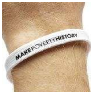
A child dies every three seconds as a result of extreme poverty. www.makepovertyhistory.ca